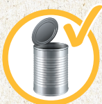
Tins and Cans