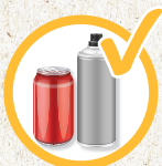
Aluminium Cans and Aerosols