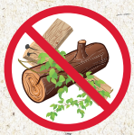
NO Garden Materials