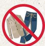
NO Clothing and Textiles