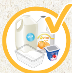
Rigid Plastic Bottles and Containers