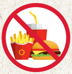
NO Food or Drinks