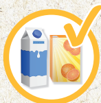
Liquid Paper Board Cartons