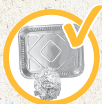
Aluminium Trays and Foil