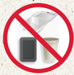
NO Polystyrene Foam